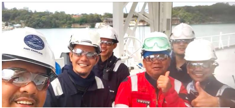
Crew of the NAVIG8 Wolf saying thanks to our supporters

A gift in a will is a valuable way to continue to show your love for seafarers, even when you can no longer do so personally - and it won't cost you anything during your lifetime.