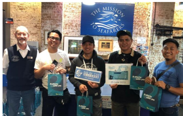
Visitors on International Day of the Seafarer