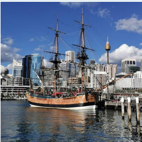
HMB Endeavour historical replica visit included in your pass if you win!